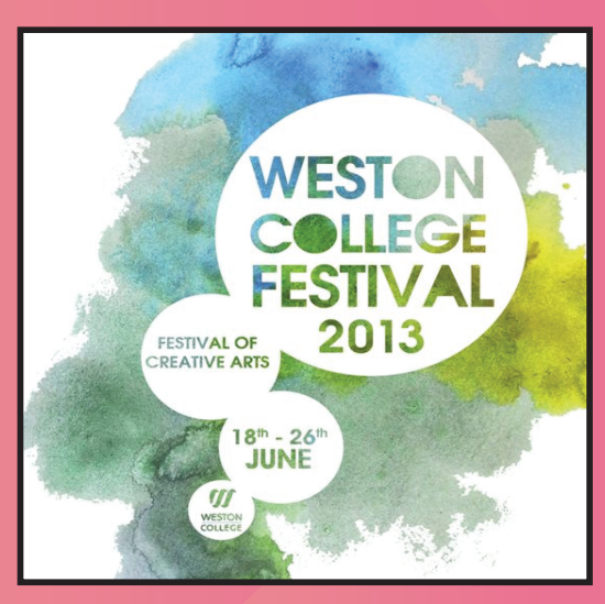
The ground of this image is created using wateroclour as the media, this creates a natural, earthy and casual feel. The choice of watercolour also creates an interesting texture, organic shapes and colours.