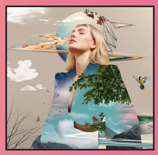
The above image is created using RASTER BASED MEDIA, you can see it is coimprised of a series of images layered on top of one another using a RASTER BASED program such as Photoshop.